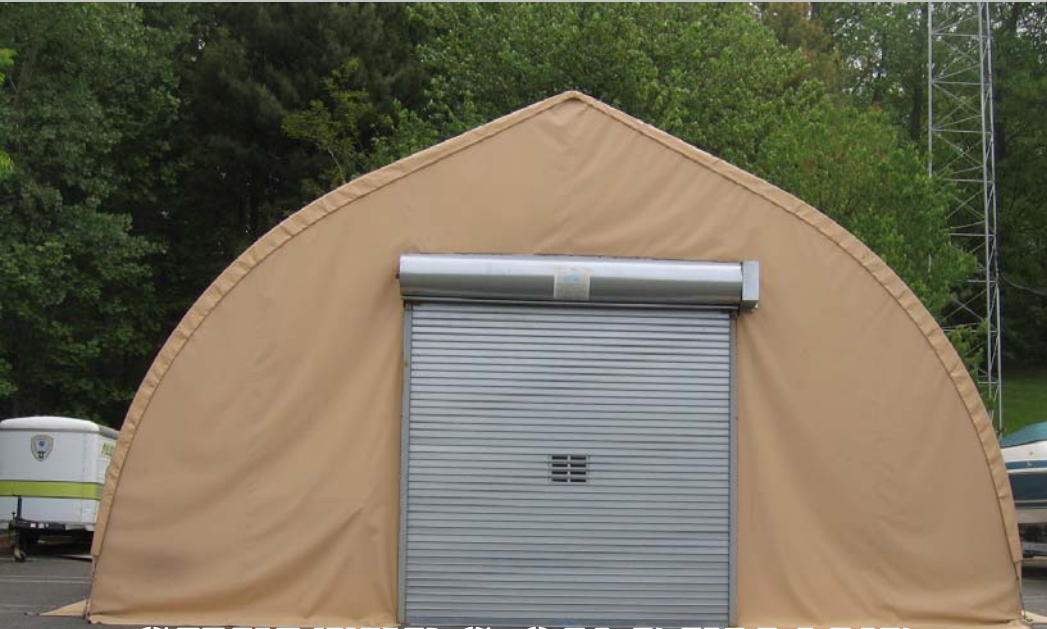
SHELTERS ON DEMAND