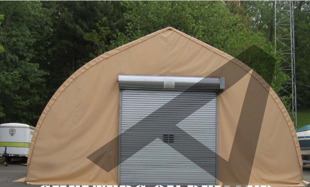
SHELTERS ON DEMAND